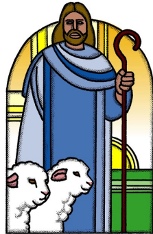
The Good Shepherd Coalition

When you order flowers to be placed for an occasion and would like to take them home, please sign up for the 1 st or 3 rd Sunday of the month nearest the event. Real flowers are ordered for those days (Communion Sundays) and silk flowers are used for the other Sundays. The cost is $15.00 regardless of real or silk. If anyone would like to make matching silk flower bouquets for the Altar Flower holders, please contact the office. It is nice to have a few sets that can be alternated throughout the year.